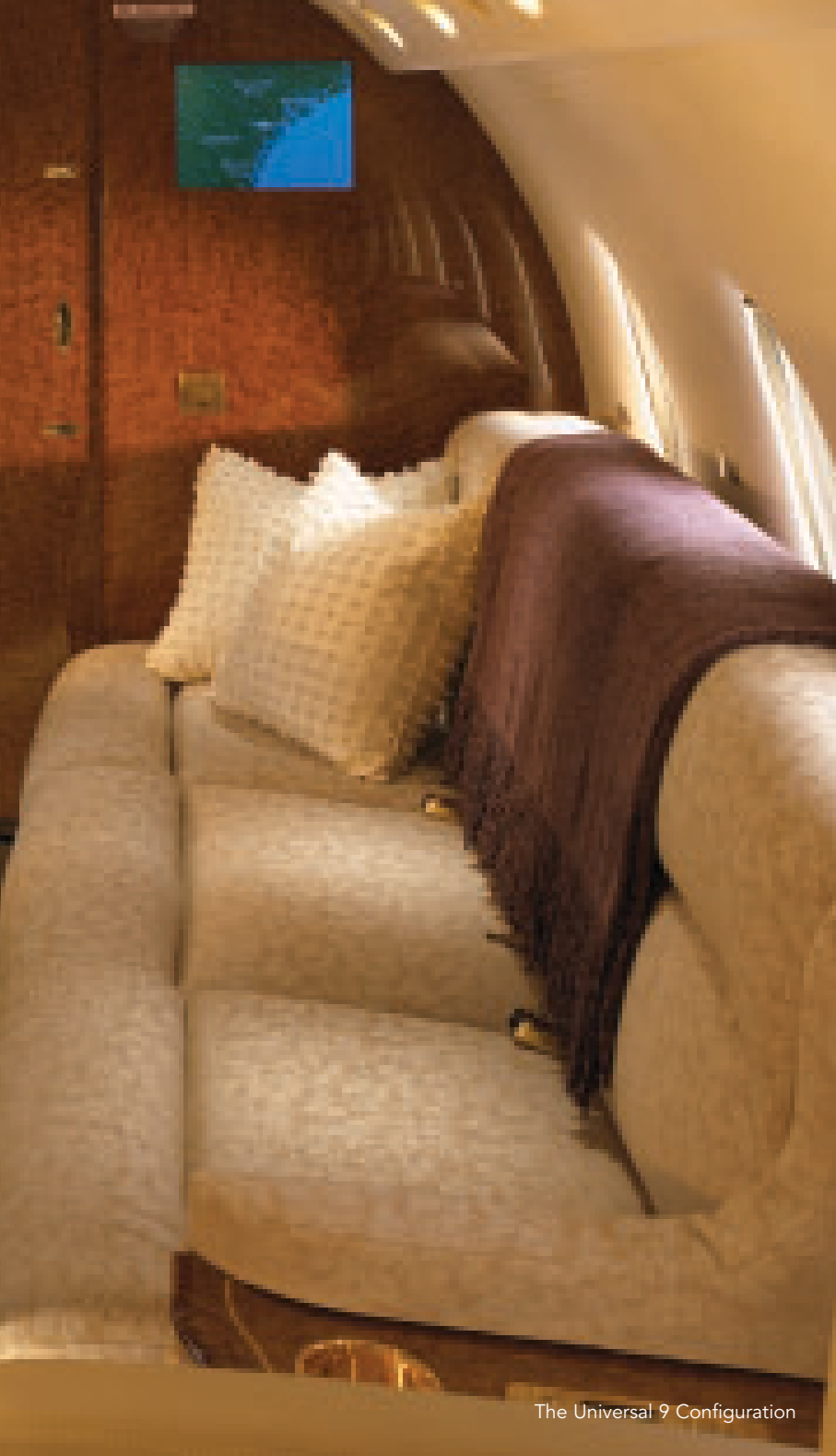
The Universal 9 Configuration